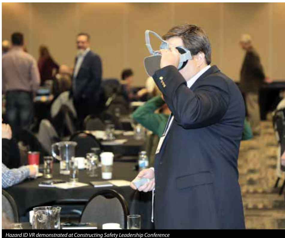
Hazard ID VR demonstrated at Constructing Safety Leadership Conference