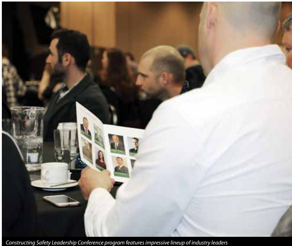
Constructing Safety Leadership Conference program features impressive lineup of industry leaders