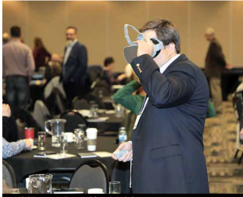
Hazard ID VR demonstrated at Constructing Safety Leadership Conference