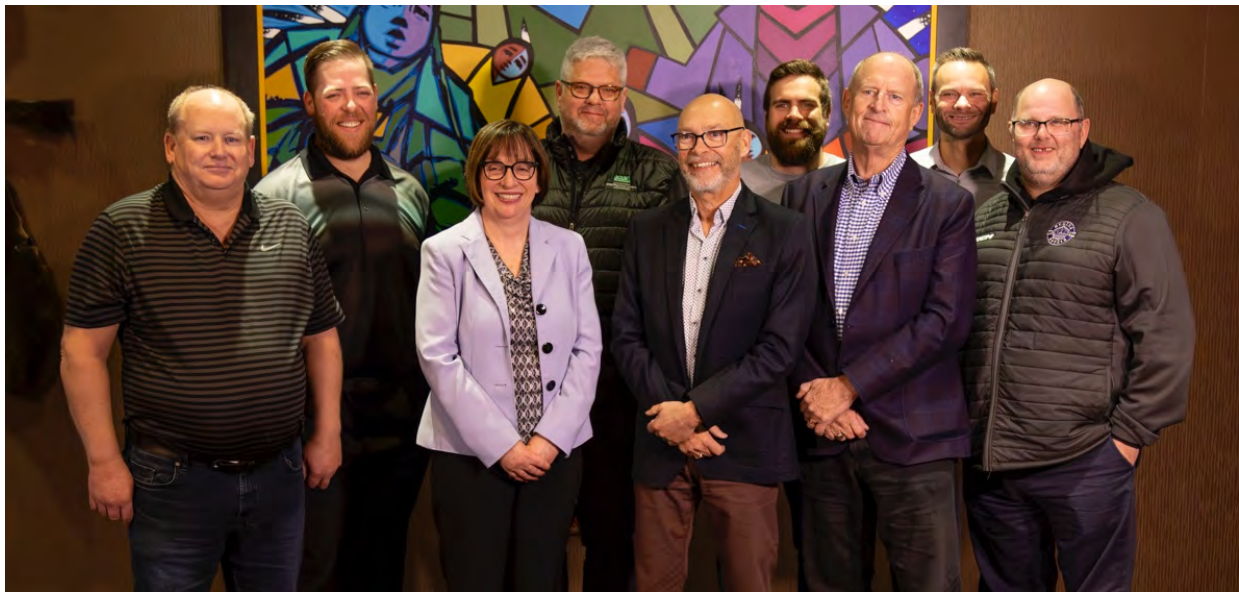
SCSA Board of Directors, March 7, 2024.