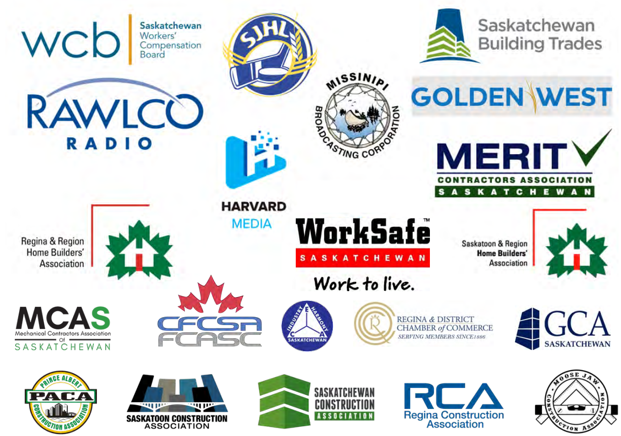
*Sample of various relationships maintained.

As a hub in the construction community, the SCSA works with numerous associations, industry groups, trade unions and media to build positive perceptions and enhance workplace safety.